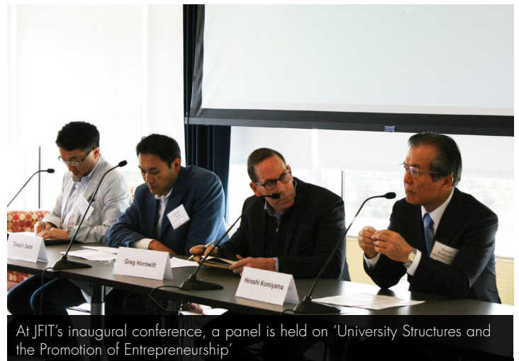
At JFIT’s inaugural conference, a panel is held on ‘University Structures and the Promotion of Entrepreneurship’